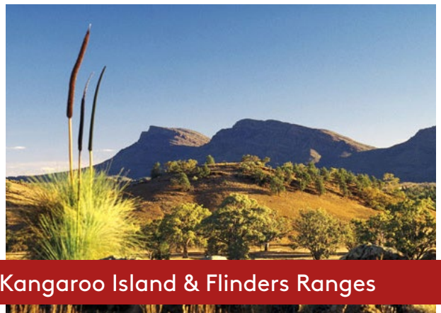
Kangaroo Island & Flinders Ranges