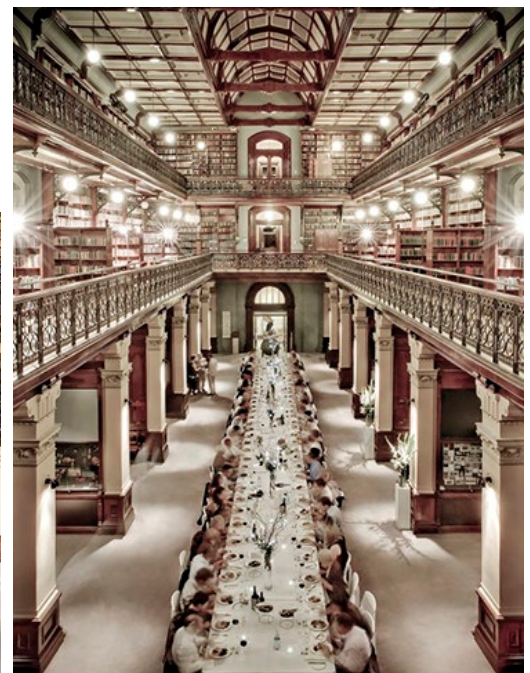
South Australian State Library, Mortlock Library