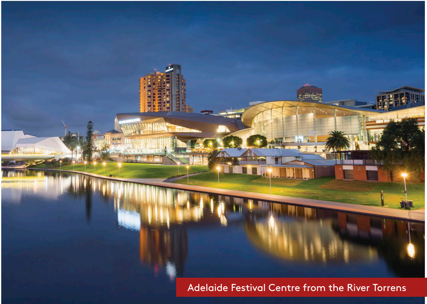
Adelaide Festival Centre from the River Torrens