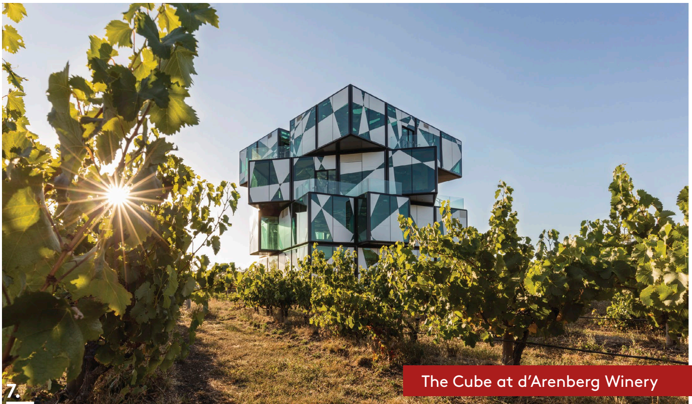
The Cube at d'Arenberg Winery

Chester and d'Arry will be on hand as we are shown around this amazing structure. We will be treated to a tasting of their famous wines (including the legendary Dead Arm Shiraz) before we enjoy a morning tea.