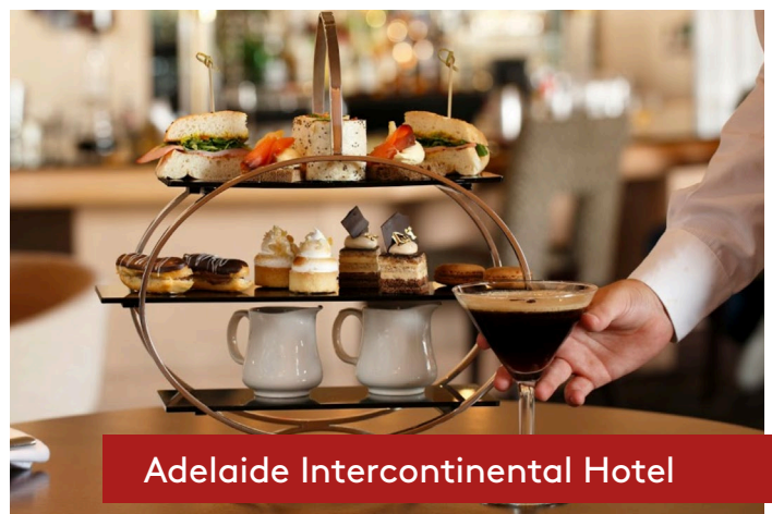
Adelaide Intercontinental Hotel