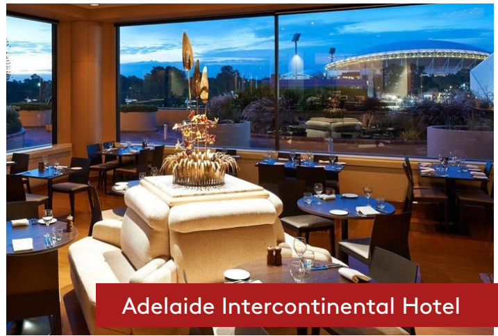
Adelaide Intercontinental Hotel