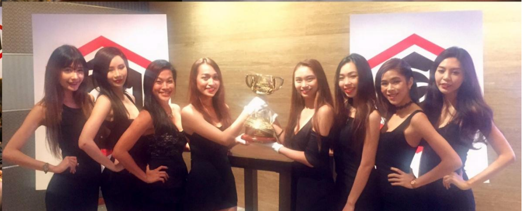
Singapore Racing Luncheon