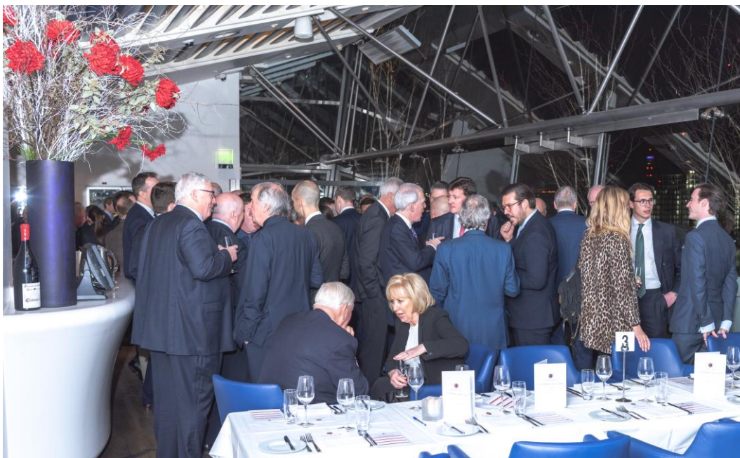
Guests enjoying a tittle before the start of proceedings at the OXO Tower restaurant

CC London has a full membership list and a small but eager waiting list – no wonder, with events like these!