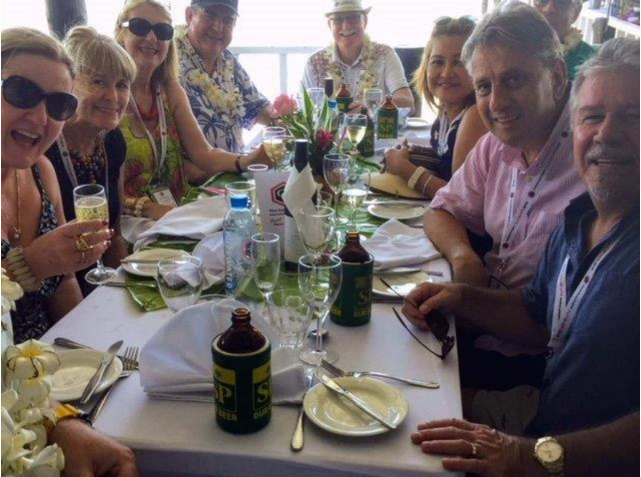
A happy group of the PNG team enjoying a well earned break