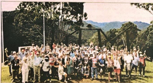
THE Carbine Congress members/delegates sightseeing at Ower's Corner, Sogeri, Central Province.