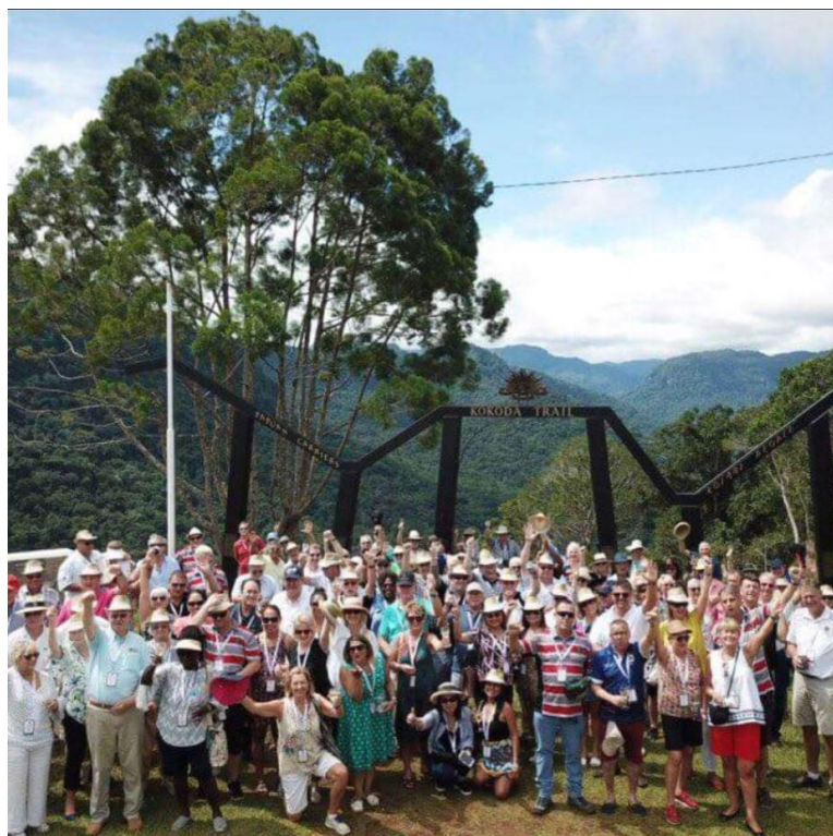
Left: the delegates at Owers Corner;