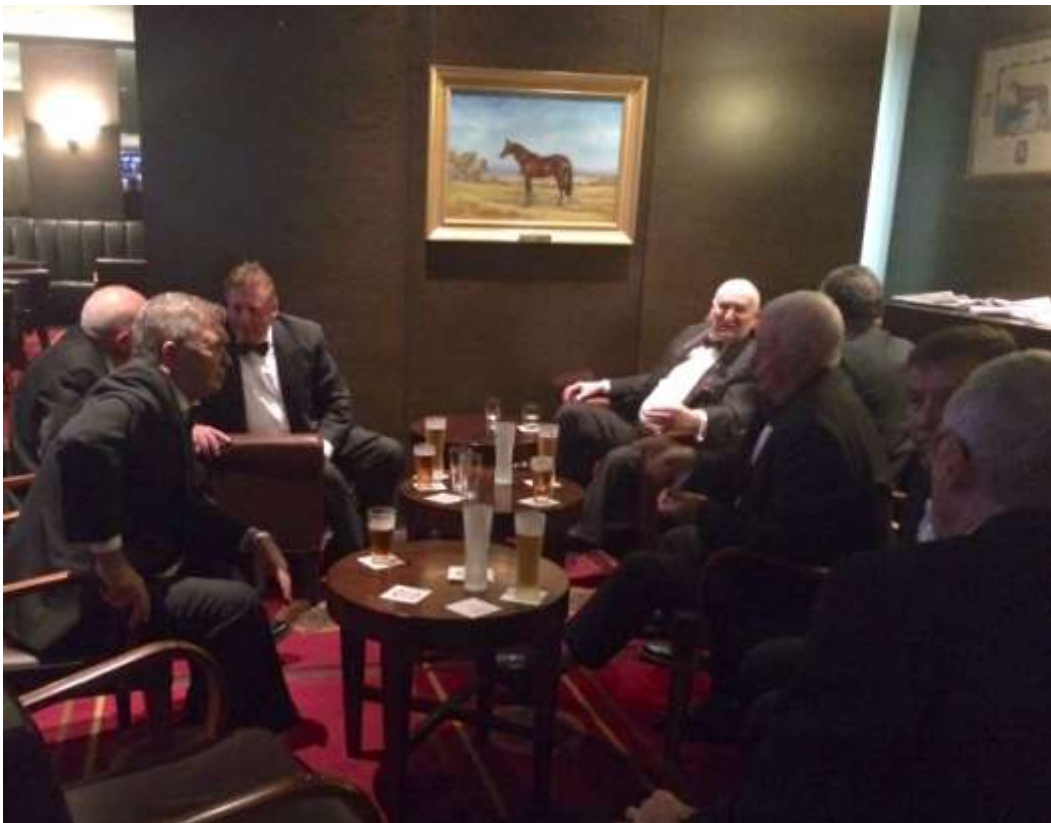
After a short break delegates reconvened at the RACV Carbine Members Bar before moving on to the Annual Dinner