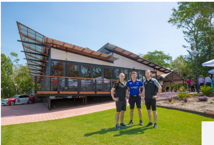
V8 Drivers enjoying the "winter" sunshine at Pee Wee's at the Point