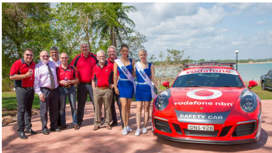
CC NT Committee with the Crownbet V8 Grid Girls

This major luncheon on the Carbine Club of NT calendar broke with tradition in 2018 with the function being held at the newly renovated Pee Wee's at the Point Restaurant overlooking the Darwin Harbour. In excess of 200 members and guests attended the luncheon for an afternoon of high octane entertainment to coincide with the Crownbet Darwin Triple Crown round of the V8 Supercars Championship held at Hidden Valley racetrack.