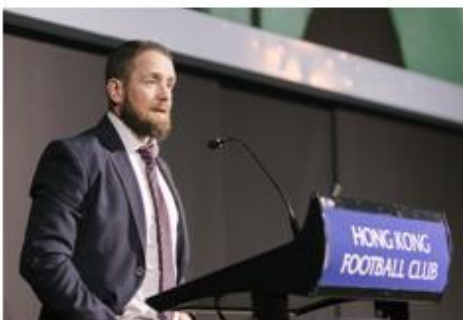
Former Welsh International Shane Williams.

Photos from CCHK Luncheon- More overleaf