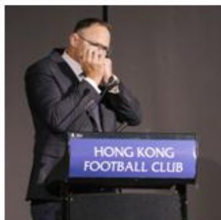
Former All Black Josh Kronfeld