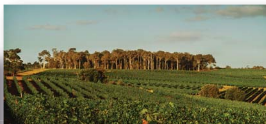
Leeuwin Estate vineyards