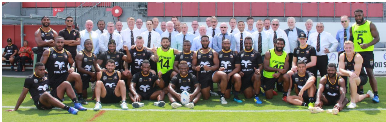
CCPNG members pose with the Kumuls

Both the Kumuls and the Orchids (the PNG National Women's side) did themselves proud by pulling off upset wins over their more fancied opponents from Great Britain the next day.