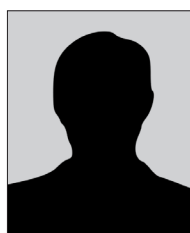
International Para' Athlete TBA