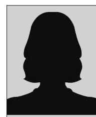
A Well Known New Zealand Sportswoman TBA

In support of the Sir Denis Blundell Charitable Trust and our objective of "assisting athletes with disability" There will be a GRAND RAFFLE | Details to be advised | Tickets will be sold during main course | Bring some CASH