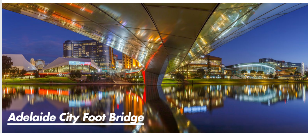
Adelaide City Foot Bridge